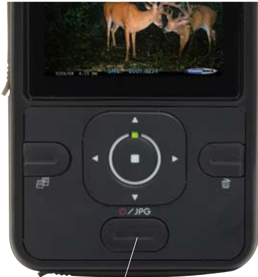
Power (on/off)/JPG key